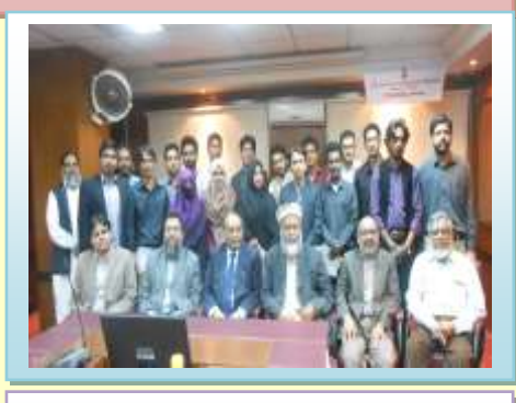
Group Photograph of IEP Official with NEDUET Students