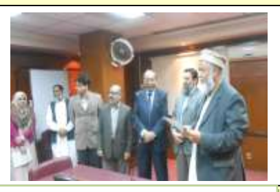
Another view of distribution of certificate to volunteer of NEDUET Student